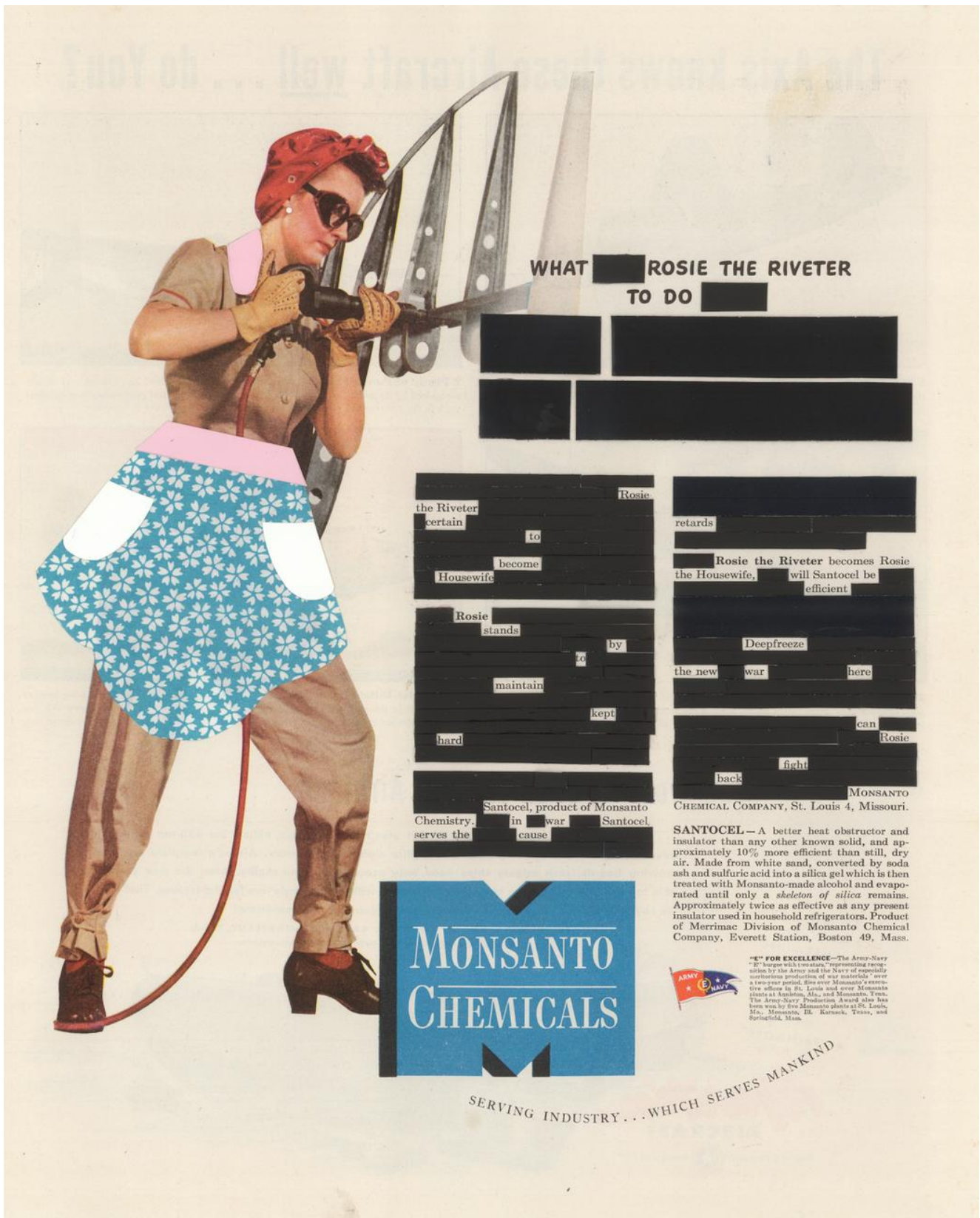
Rosie, 2013, Kirsten Stolle, Collage on magazine advertisement.

"These are adverts that would've been found in Time Magazine , Life magazine, Fortune magazine, from 1944 up until 1960," says Stolle. "They're promoting their chemicals to use during wartime: insecticides and herbicides for the home