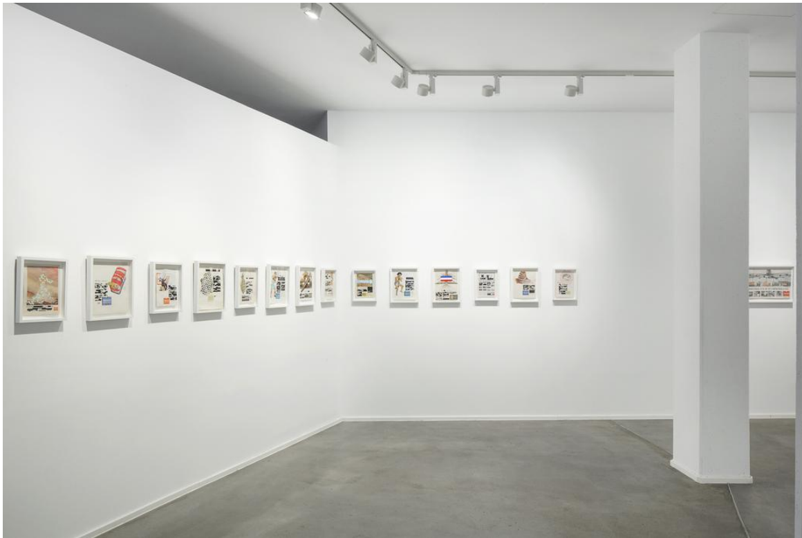
Proceed At Your Own Risk by Kirsten Stolle at NOME.

Stolle's additions also take the form of colorful collaged dots and fantastical doodles that nod to the more contemporary scientific procedures that chemical and food conglomerates engage in, such as genetic modification, or "pharming" (a biotech process of genetically modifying plants or animals to produce medicinal substances).