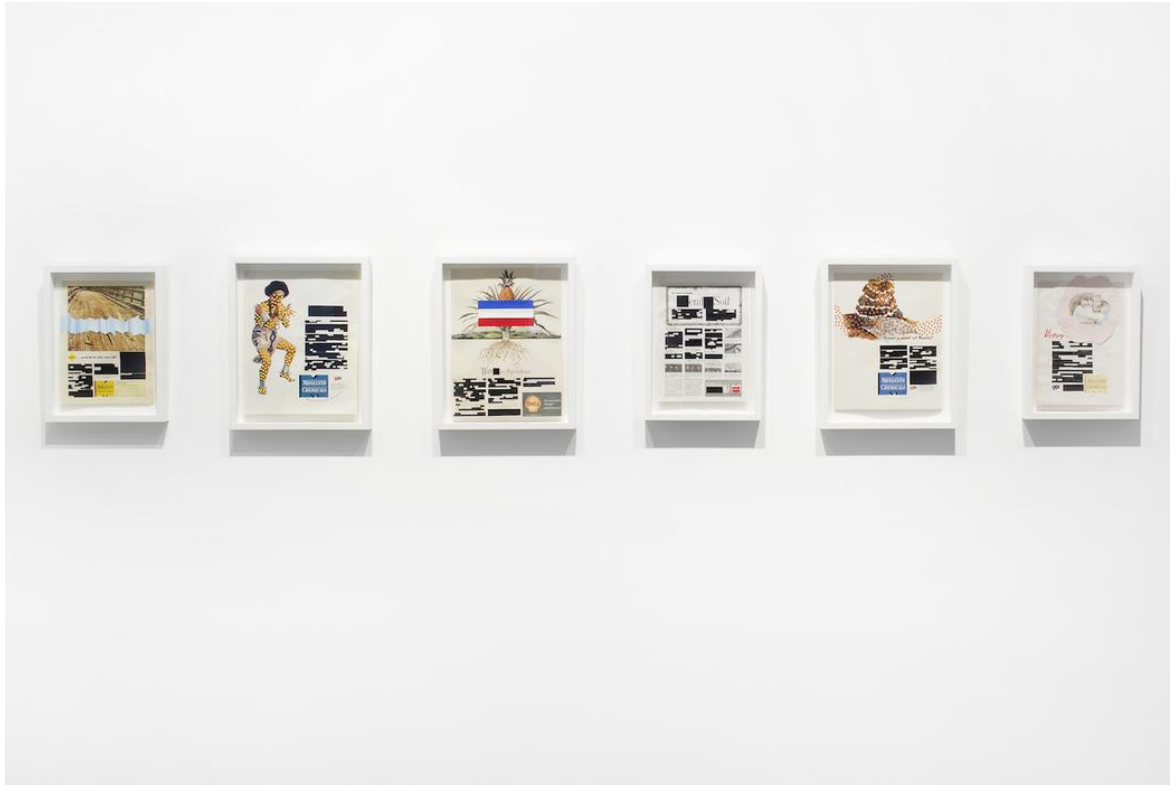
Proceed At Your Own Risk by Kirsten Stolle at NOME.

Today, Monsanto is perhaps best known as a food producer, with much of its toxic, warmongering past forgotten. Stolle is fascinated by this greenwashing: "Their website, as it is today, hardly uses the word 'chemical' at all. 'Monsanto: a sustainable agriculture company'—sustainable for who?"