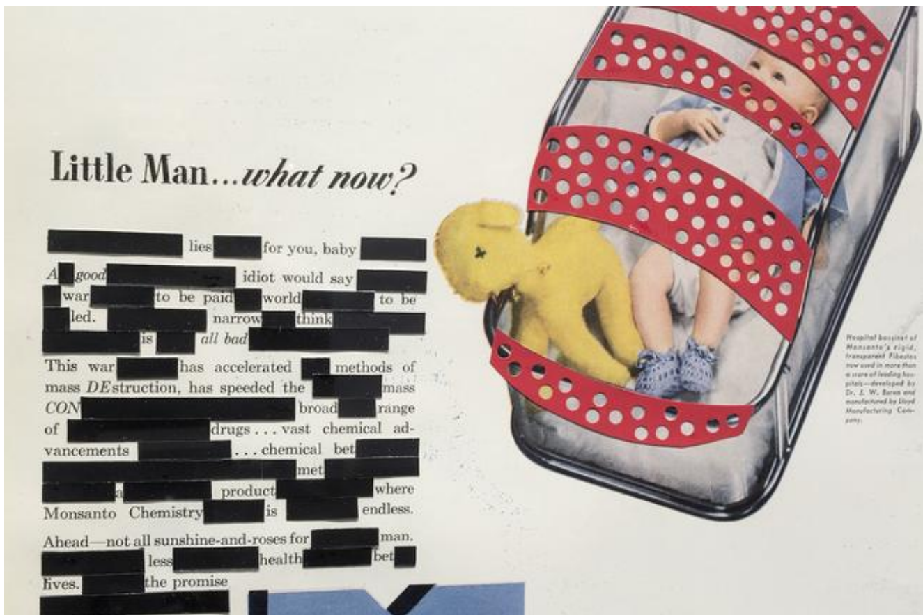
Little Man now what?, Kirsten Stolle, 2013.

Many of the collages leverage redaction—thick black cards stuck over sections of the text—next to the cheerful domestic illustrations of the commercials. "When governments redact sensitive information, they're hiding something," Stolle explains. "I wanted to change the language to read as what they truly are. Their agenda is to make money." These redactions turn the text into something harsh yet beautiful: "Make Insect Profit!" "War in paradise," and "The condemned hear." "To me, they're sort of like postmodern poetry," Stolle says.